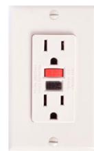
Ground Fault Circuit Interrupter (GFCI)